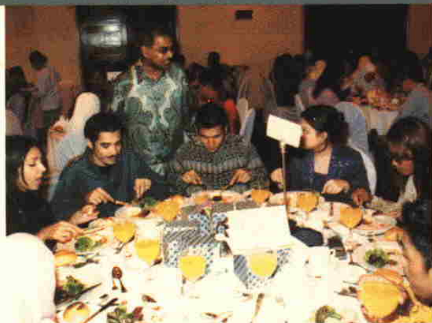
● It takes a pretty smooth guy like the Senior Vice President to be able to blend in with various age groups

The Organising Committee would like to thank all staff, guests from Open University Thailand, UK, Korea and India, the Board of Directors and the Academic Board for making the dinner a success.