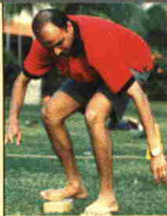
● Where will I hide my face if my students see this?

T he 3-day Executive Retreat, held from 28-30 June 2002 at the Guoman Resort, Port Dickson proved that academicians can be just as laid back as our fellow students.