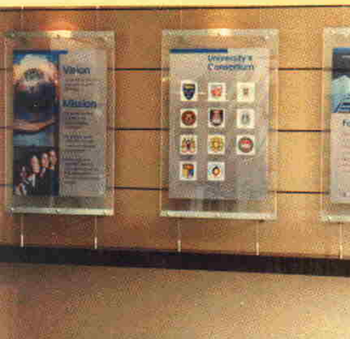
You'll be surprised how much you can learn about the University from these posters

Local or foreign artists who want intimate space for their artworks may find it at the gallery which is reserved for temporary exhibitions. Another purpose of the gallery is to ensure that there is constant change in the exhibition schedule in order to attract multiple visits to OU Malaysia. It is also announced that exhibits displayed in the gallery would change periodically with up to five different exhibitions a year.