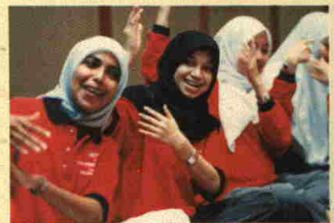
● Your guess is just as good as ours. We still can't figure out if those grins were out of embarrassment or enjoyment

their personal goals and motives, and meet their targets. Some of the activities included ring tossing, picture story writing and tower building. This was probably the first time we witnessed all staff gathered together while engaging in the same activity and laughing hysterically at each other.