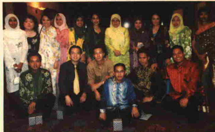
● Strike a pose

Gone were the modest and conservative pants and suits, the neatly gelled hair to tame all the frizz and flyaways, the decent earth tone make-up that doesn't stand out and shout, "look at me!" and in were the chic and classy kebayas and batiks , the extravagant hairdos' adorned with elaborated ornaments, mesmerizing smoky eyes with black liners and metallic eyeshadows in shades of grey and bronze.