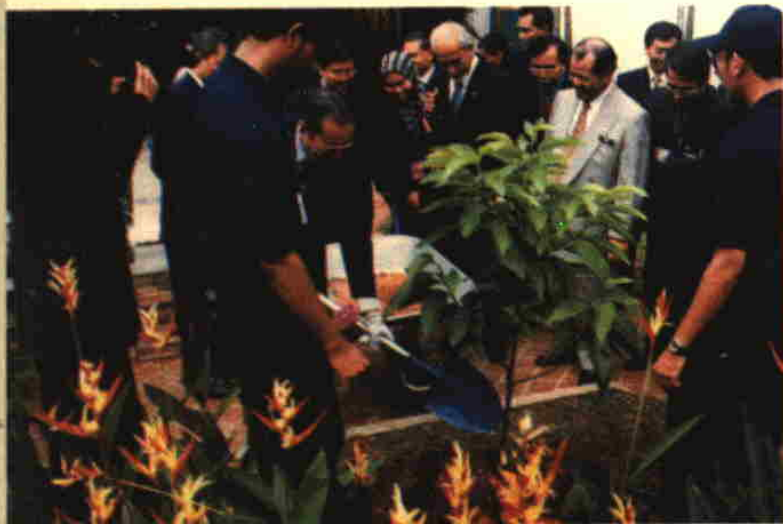
● In commemoration to the significant event, YAB Prime Minister planted a Michelia champaca (Magnoliaceae) tree during the tree planting ceremony