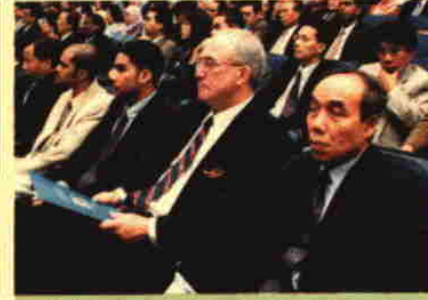
VIPs who witnessed the auspicious ceremony