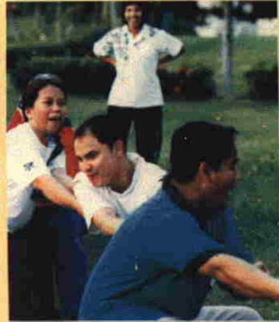
Scenario: Sweaty men after a game of tug of war A man's view - Resembling those muscular hunks in Baywatch A woman's view - resembling a bunch of 10-year olds