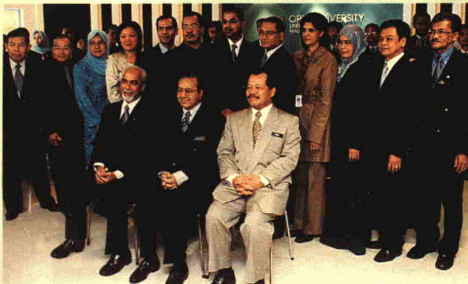
● A moment to be cherished forever – OU Malaysia's top management staff at a photo shoot with YAB Prime Minister and the Minister of Education