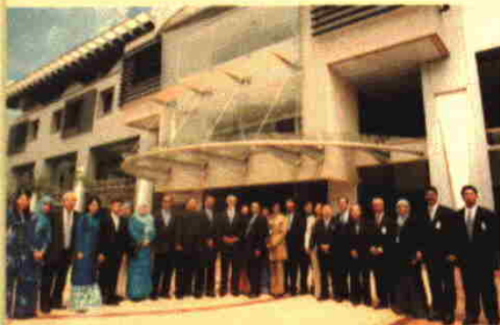
Staff of OU Malaysia posing as a group after the big success of the launch