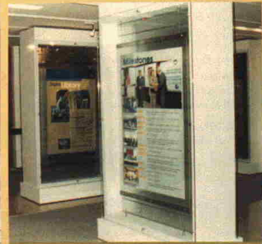
The extensive collection of posters mounted behind tall, framed glass panels