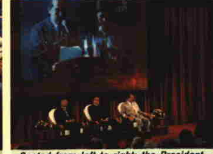
Seated from left to right: the President of OU Malaysia, YAB Prime Minister of Malaysia and the Minister of Education, Malaysia