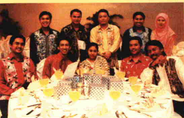
Doesn't this remind you of a toothpaste commercial?