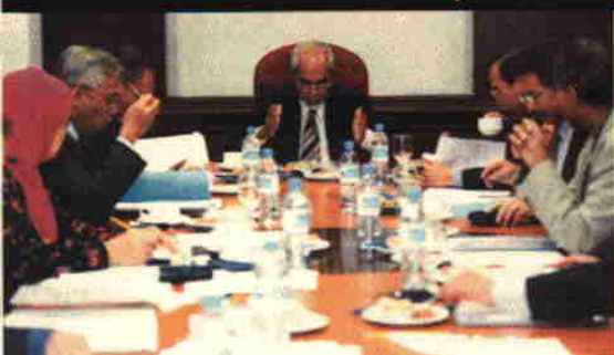
● Meeting of OU Malaysia's Board of Directors