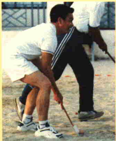
Darn, there goes the ball