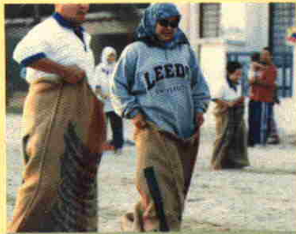
Did you honestly think we adults can't beat you in a game like this?