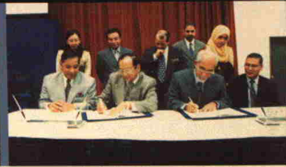
● YB Tan Sri Dato' Seri Musa Mohamad, Minister of Education, witnessing the signing ceremony between the President and Y Bhg Dato' Haji Ambrin bin Buang, Secretary-General, Ministry of Education