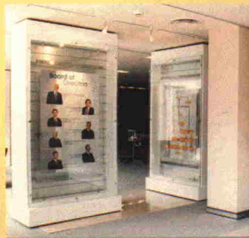
Some of the full-blown posters displayed in the gallery