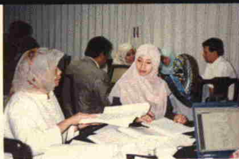
● Participants in hot discussion at the Module Writing workshop