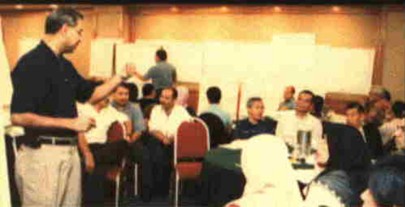
● Alright, enough of games. Let's get serious