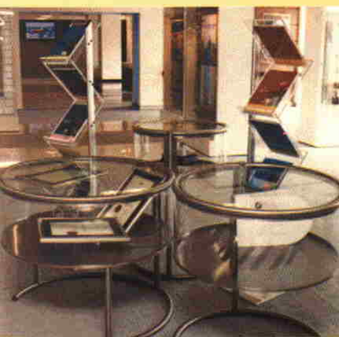
The cylindrical cases that display the authentic certificates and the replica of the crystal book given to the Prime Minister