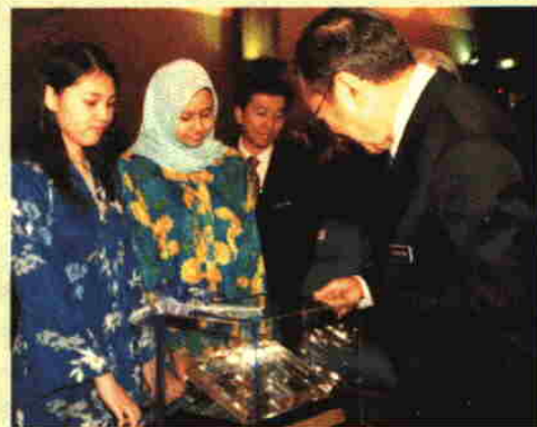
● YAB Prime Minister accepting a souvenir – a crystal book engraved with gold wordings quoted from one of his speeches in 1996

In less than a year's time, OU Malaysia has enrolled more than 6,500 students nationwide, an astonishing figure that goes far beyond our expectations. Under the visionary leadership of YBhg Tan Sri, the University has developed a solid foundation in distance and online learning, highlighting on Information Technology and Business & Management education – two of the most demanded categories in today's emerging technology- and knowledge-based society.