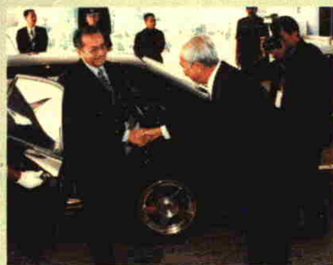
● The President greeting YAB Prime Minister upon his arrival

As such, the establishment of OU Malaysia couldn't had come at a better time. As noted by YAB Dato Seri, "OU Malaysia is responding to the society's needs by providing opportunities to cross sections of the Malaysian society, especially working people."