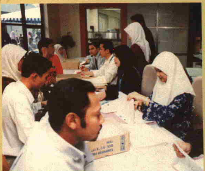
• Staff of OU Malaysia assisting students in their registration for classes

A record breaking of 2,334 students were registered for various undergraduate programmes at OU Malaysia on 2 and 3 August 2002. Statistics showed that 1,264 students registered in the mainstream category while the rest registered for the Bachelor Degree Programmes for Non-Graduate Teachers. A variety of activities were conducted to provide these freshmen with information on tertiary education and a demonstration on a range of practical learning skills. This was arranged to ensure the smoothness of one's transition to the learning environment of OU Malaysia.