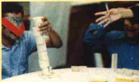
It's going down, put put it up