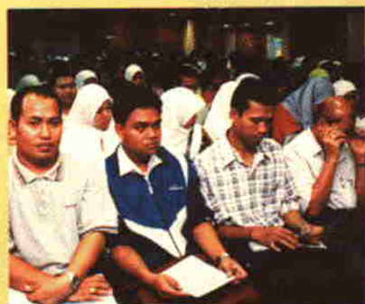
• A shocking number of students showed up at the registration