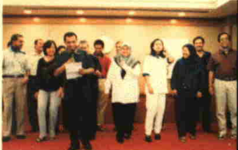
● Cowboy scarves around the necks can only mean one thing - It's a rodeo show!

That Saturday morning of 8 June 2002 at Corus Paradise Resort, Port Dickson was just your typical, everyday weekend. A quiet and serene paradise with lush verdant surroundings. It took only a matter of seconds for the 40 boisterous senior management staff to shatter the tranquility.