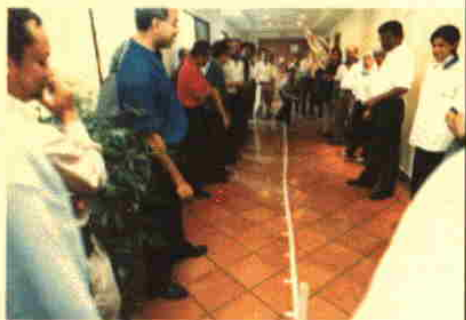
● We said "toss one ring at a time, not three in a row"