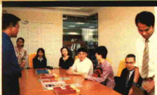
● Playing host to visitors from the Central Agriculture Broadcasting Television School, China