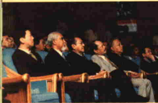
The President, joined by YAB Prime Minister and other ministers, during the corporate video presentation