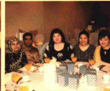
It was a night full of beautiful people parading around in glamorous gowns and suits