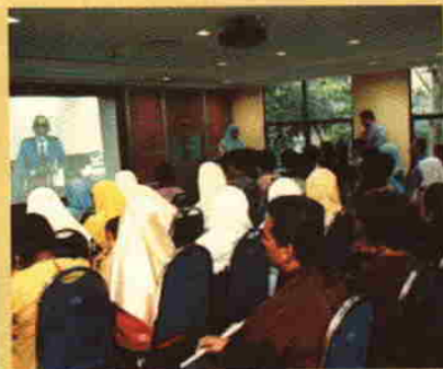
• Students at a presentation