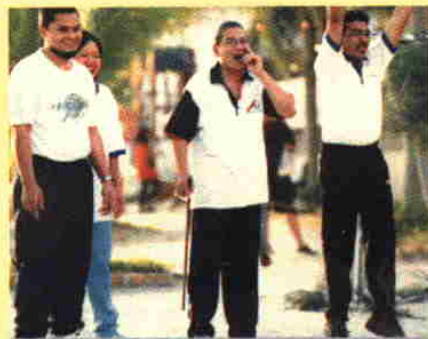
Yo, my man! What's taking you so long?! The other group's winning already!