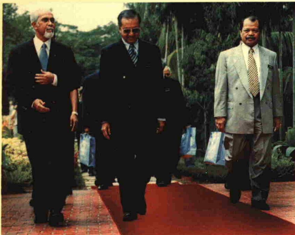
● YAB Prime Minister escorted by the President and the Minister of Education after the tree planting ceremony

As such, the establishment of OU Malaysia couldn't had come at a better time. As noted by YAB Dato Seri, "OU Malaysia is responding to the society's needs by providing opportunities to cross sections of the Malaysian society, especially working people."