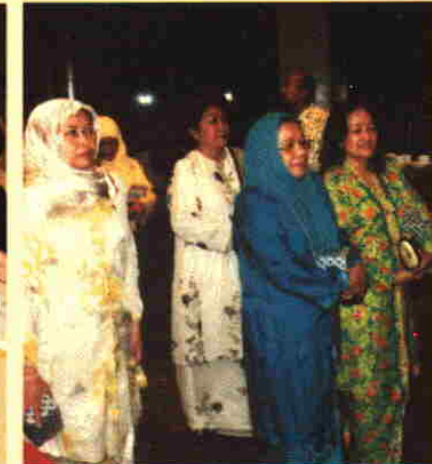
Some of the VIPs who attended the dinner