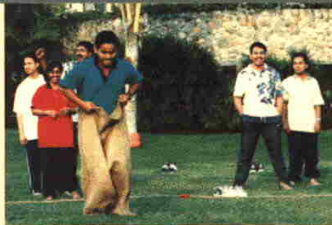
● Will this torment ever end?!