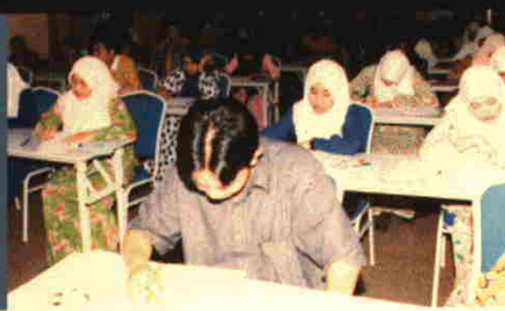
● Students of Jaya Jusco Apprentice Scheme sitting for an examination