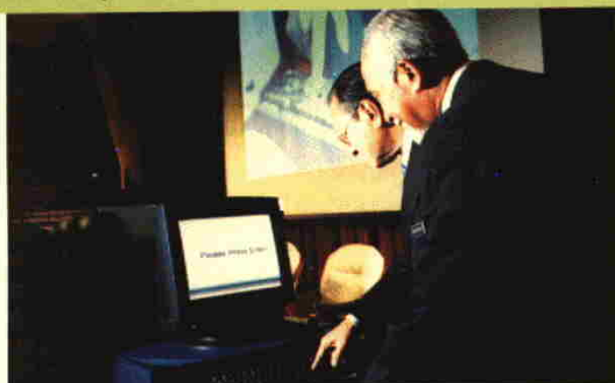
● YAB Prime Minister pressing the launch button as the President looks on

Speaking at the epoch-making ceremony, YAB Dato Seri said, "Clearly there is a big role for off-campus distance learning education. It will probably become bigger than on-campus university education. It will help produce the knowledgeable workers so essential for our knowledge- and IT-based industries. It will make our country proficient and capable of competing in a world that is being propelled by knowledge through the new communications technologies."