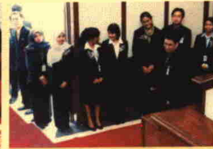
Usherette #1: What was that noise? Usherette #2: I think the butterflies in my stomach are evolving into another species