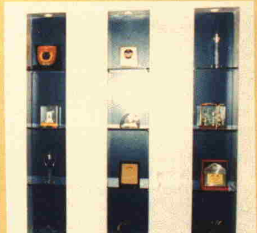
The University's Wall of Fame