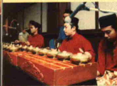
Mastering a tune on the Cak Lampong – a traditional Malay musical instrument