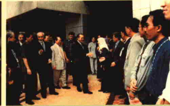
Getting a hand shake from YAB Prime Minister, that's not an opportunity to be missed