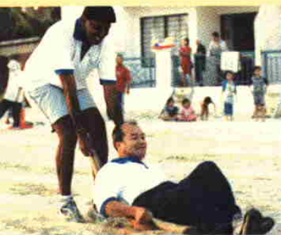
For those who suffer from calcium deficiency, it is strongly advised that you stay out of this game