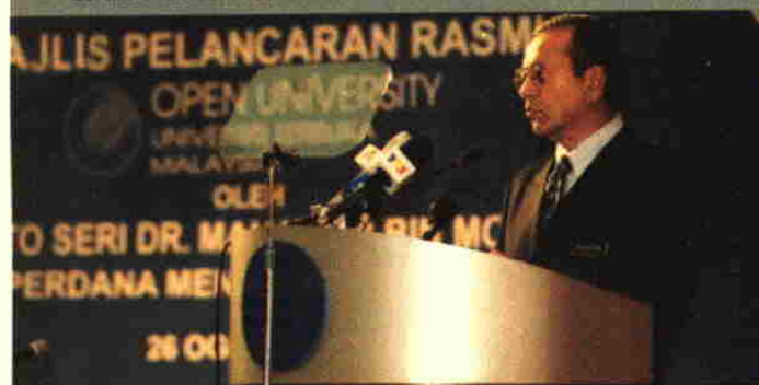
● Keynote address by YAB Prime Minister