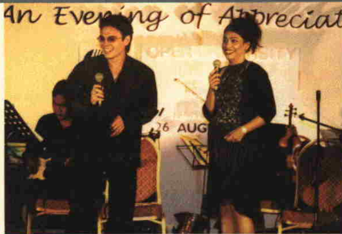
● It took only seconds for these two amazing artists to stir up the crowd....tough crowd I would say