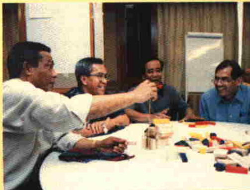
Hey, it's not as easy as you think it is!