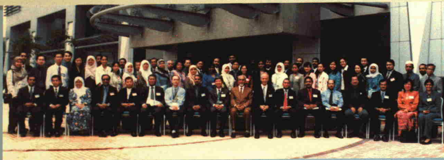
● Participants at the workshop

At OU Malaysia, we recognize the importance of quality assurance and the need to retain and improve that excellent standard in our academic programmes to ensure that students get the best of education from our abilities. As such, a quality assurance workshop was held on 23rd and 24th August 2002 as a pre-launch activity at OU Malaysia's main campus with the following objectives:-