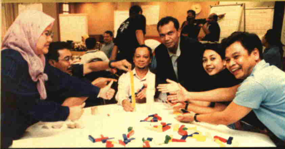
● Thumbs up for the winning group of the tallest tower built