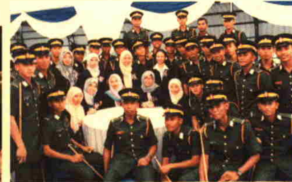
Now, how often do you get armies swarming around you?