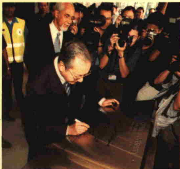
● The President and the Minister of Education witnessing the plaque signing ceremony as YAB Prime Minister signed the bronze plate