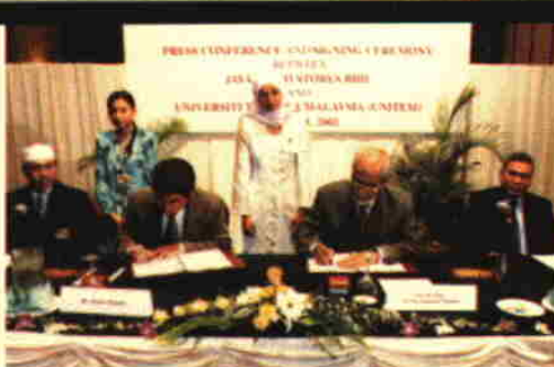
● OU Malaysia and Jaya Jusco Stores Bhd. at an MoA signing ceremony