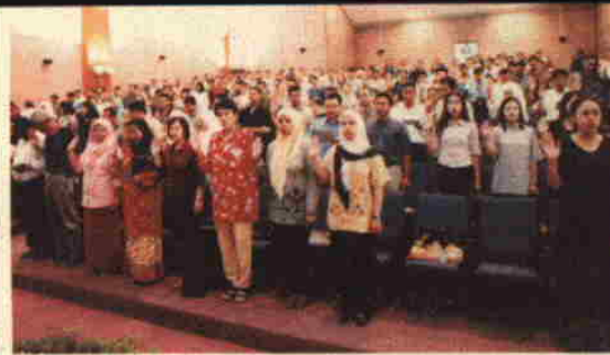
● Oath-taking ceremony at the 3rd student registration session