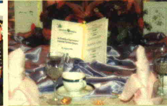
Sigh, the memories of the dinner never failed to get us misty-eyed