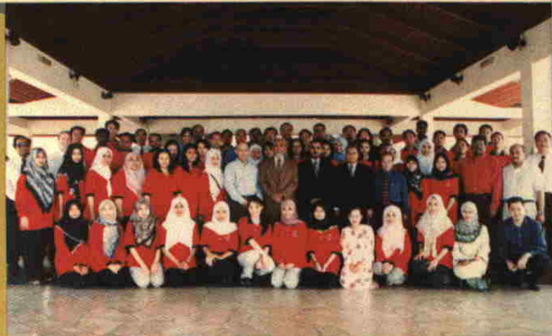
● Vote for the best looking person here!

W ho says the wild days are over once you step out of university, join a group of intellectuals trying their brains trying to write a 2-inch thick textbook on the chemical reaction between hydrogen peroxide and 2,3-dihydroxybutanedioate ions and God knows how many hours you've spent gawking through the microscope with those safety goggles on.