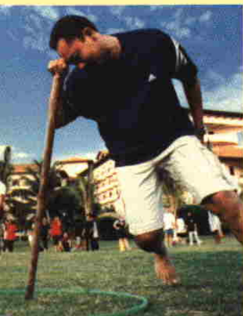
Round and round you go