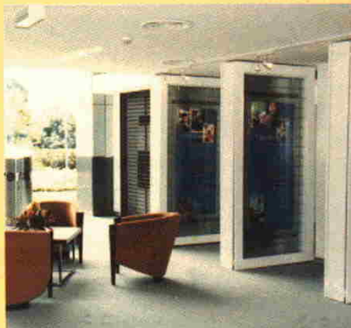
This place has become the favourite hangout for most of our staff since the couches were placed here – another reason to have a cuppa joe to go