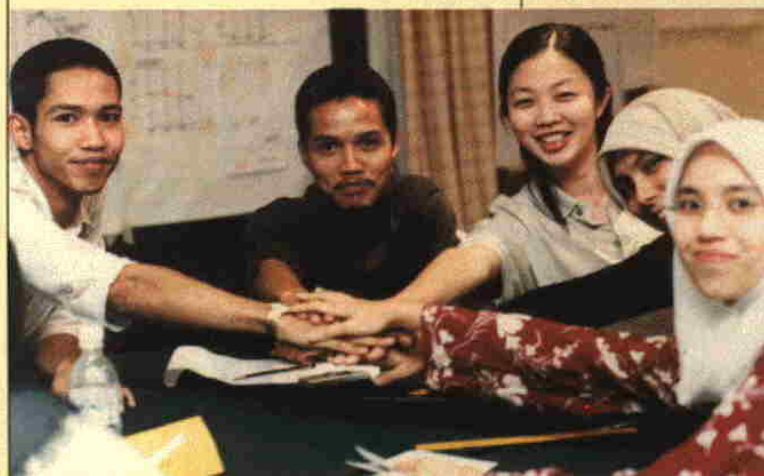
● Let's make it all for one and all for love