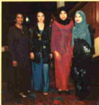
These are the ladies you want to suck up to – the secretaries of the University's top management staff