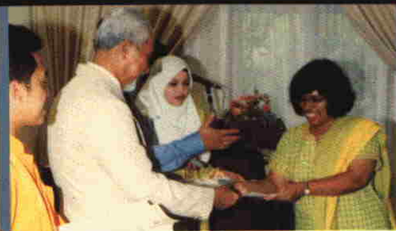
● The President awarding certificates to Sri Lankan teachers upon the completion of a 3-week Short Term Development Programme